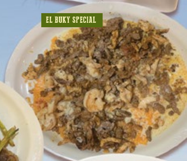
EL BUKY SPECIAL