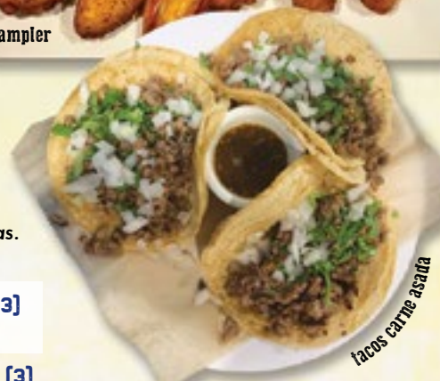
tacos carne asada