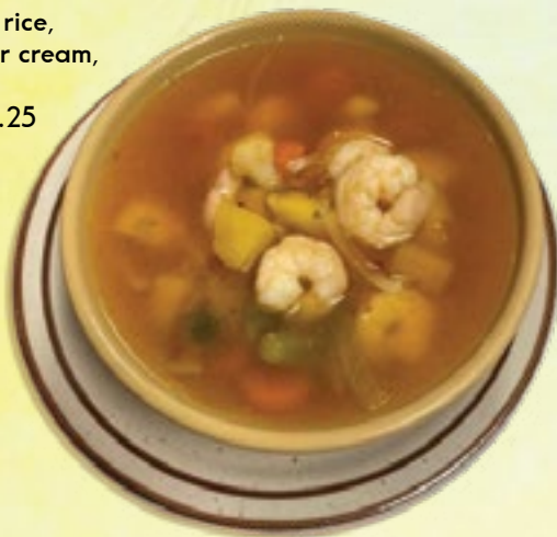
CALDO DE CAMARON - 19.99