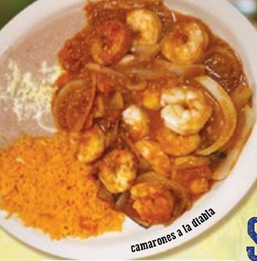
camarones a la diabla