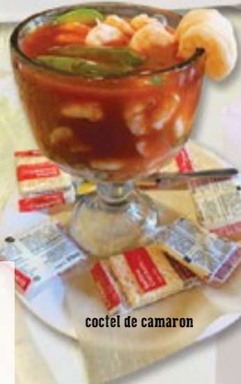
coctel de camaron