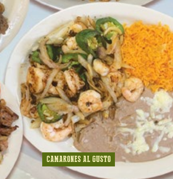
CAMARONES AL GUSTO